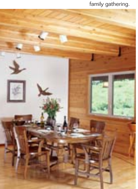
RIGHT: The kitchen is one of Martha's favorite rooms in the house. It features plenty of space to cook for a crew, natural light streaming in through picture windows, a two-tiered counter, and an open plan to stay in contact with the guests. BELOW: Dining with the Cichellis usually involves a crowd. The spacious dining room can easily accommodate a large social dinner party or

46 . country's best log homes . floor plan & design guide 2008